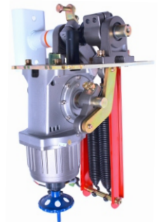
DC Brush Less Motor

The XE-132 brush less motor barrier gate series, latest researched and developed. Adopted to international advanced technology, mechanical and electrical integrated design. Planetary gear drive, high torque, un-blocked, oil tight, zero noise, mold die-casting manufacturing technology, no clutch design and 10 million operation cycles. High speed operation and fast rapid response, reliable, curved crank arm three link structure and speed can be adjusted based on the vehicle flow and arm length. This series brush less motor barrier gate is free debugging and easy maintenance, fully automated and intelligent for fast and smooth, more longer service life.